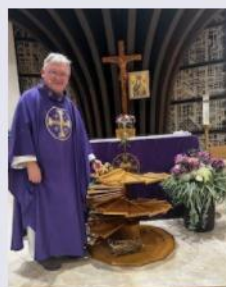
Awaiting the arrival of Baby Jesus