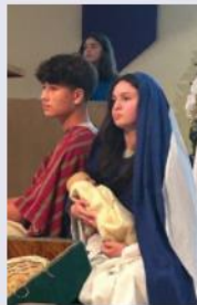
The Holy Family as portrayed in the School Pageant