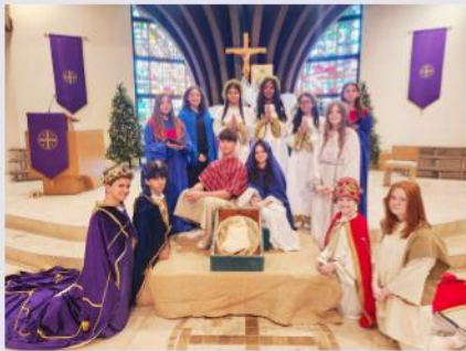
The Annual School Christmas Pageant

Thank you to all that made the season so special