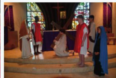
The Passion and Crucifixion of Jesus Christ