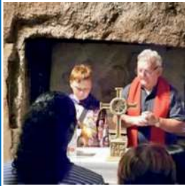
STS Youth Group Tour of Italy