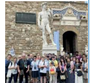
Statue of David