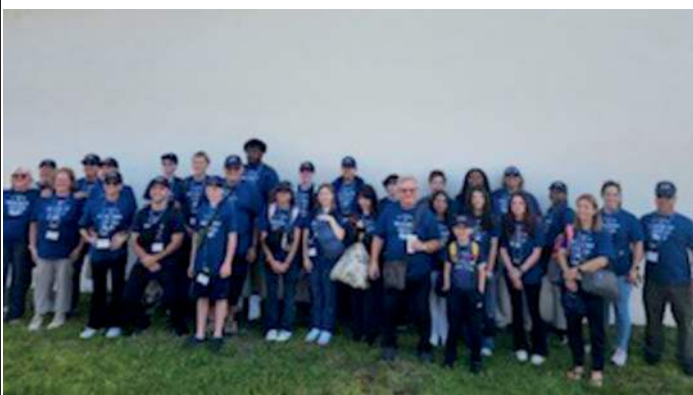
On the way– Waiting to board the bus to the airport