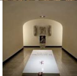
Tomb of Pope Pius VI